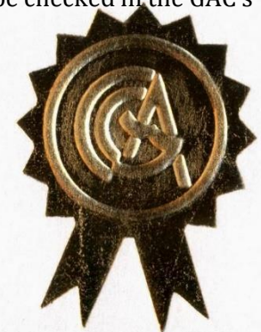
Director General, GCC Accreditation Center.

Internal project number: AC 0157-2 Initial Accreditation Date: 17 Oct. 2019